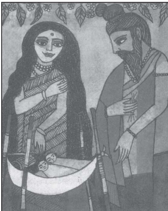
Abandoned Sita in Balmiki's ashram. Her dignified suffering inspired many a rewriting of Ramkatha.

The popular obsession with Sita's predicament is rooted in the three episodes after the liberation of Sita from Ravan's captivity. The first is the agnipariksha (ordeal by fire), which she must undergo to prove her purity, and so publicly display her worthiness in order to be taken back as Ram's queen. The second is the way she handles her banishment by Ram in deference to public doubts about her chastity. The third is the manner in which she rejects Ram's demand for a second fire ordeal, through an appeal to her mother, Prithvi (the Earth), to receive her back into her womb.