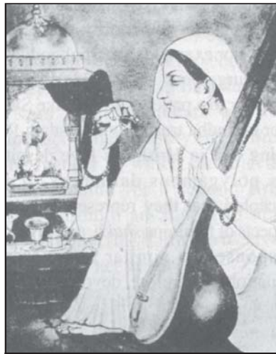
Mirabai : freedom through bhakti .

My interpretation is not too far fetched, given that I saw the living example of one of my grand-aunts who, in her own way, did many of the things Mirabai had done. She was a fashionable socialite in her youth, but was married to an unsociable, scholarly type of man.