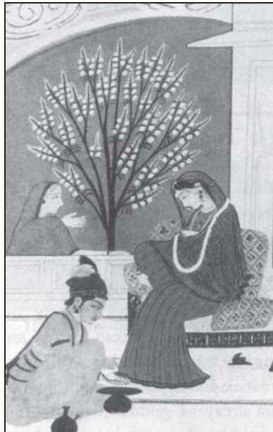
Krishna washing Radha's feet.

Even though goddess worship is a living and growing tradition in India starting as early as the Harappan culture of 3000 BC (if not earlier), there have been a good deal of fluctuations in the fortunes of various goddesses. Some ancient ones have continued