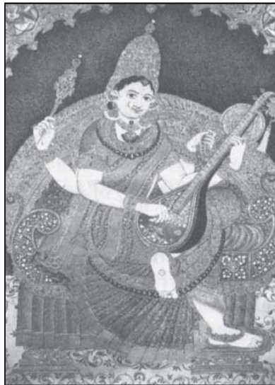
Saraswati, goddess of learning

Thus, Hindu devis and devatas are not distant heavenly figures, but a living presence in most people's lives. They hold a powerful sway as moral